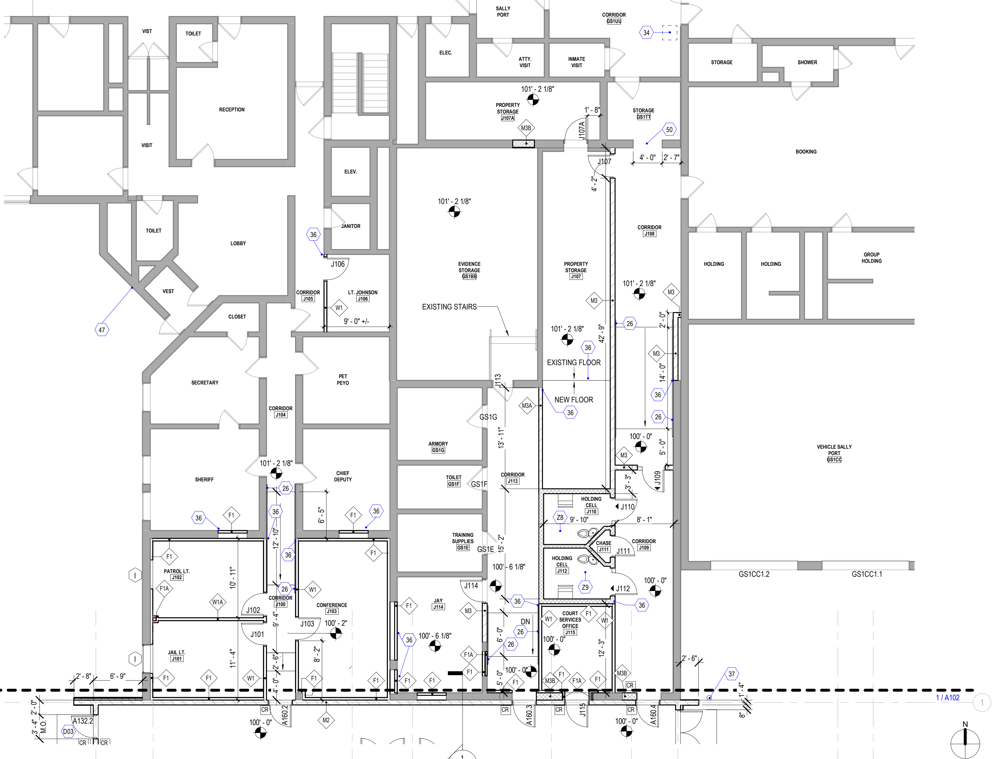
2 Jail Alteration Area 1/8" = 1'-0"