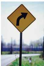
The curve on CTH NN at Gurno Lake Road will be reconstructed under a safety grant awarded to Sawyer County.

The Sawyer County Highway Department was awarded a safety grant from the Wisconsin Department of Transportation to reconstruct a segment of County Road NN at Gurno Lake Road.